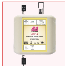
nSTS-E SimulCharge™, Ethernet Adapter for Samsung Micro USB Tablets