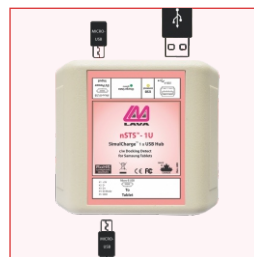
nSTS-1U SimulCharge™, 1 x USB Adapter for Samsung Micro USB Tablets