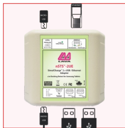
nSTS-2UE SimulCharge™, Ethernet, 2 x USB Adapter for Samsung Micro USB Tablets

Units with a 5-volt power input allow the mobile device to be up to 6 feet (2 meters) away from the power supply. This is the standard power option for mobile devices. Any regulated 5-volt, 2-amp (DCP-capable) power supply can be used. Though, it is recommended you use the charger that came with the mobile device.